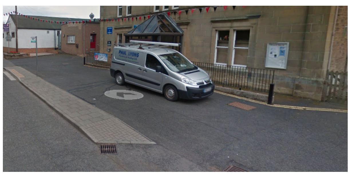
The area above should be used for load-in, if required. Vehicles should then be parked as above.