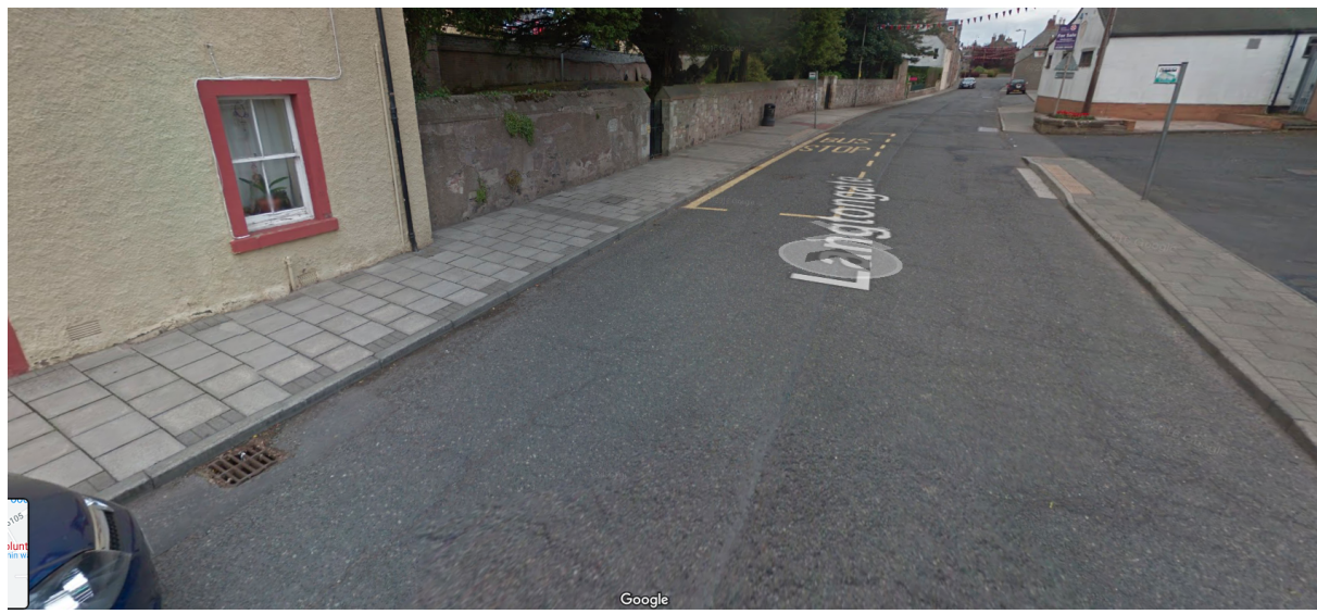
On street parking where pictured, on left-hand (North) side of the road. Venue to the right, out of shot.

There is ample on and off-street parking for performers at the venue.